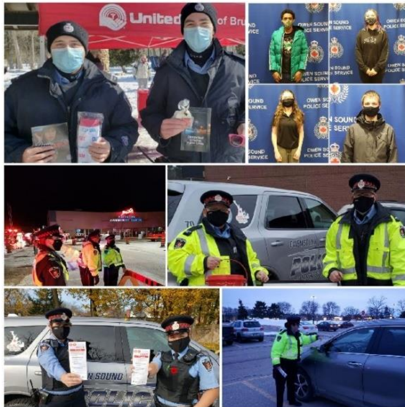
Picture from Volunteer Appreciation Week- COP, Aux, Youth including YIPI